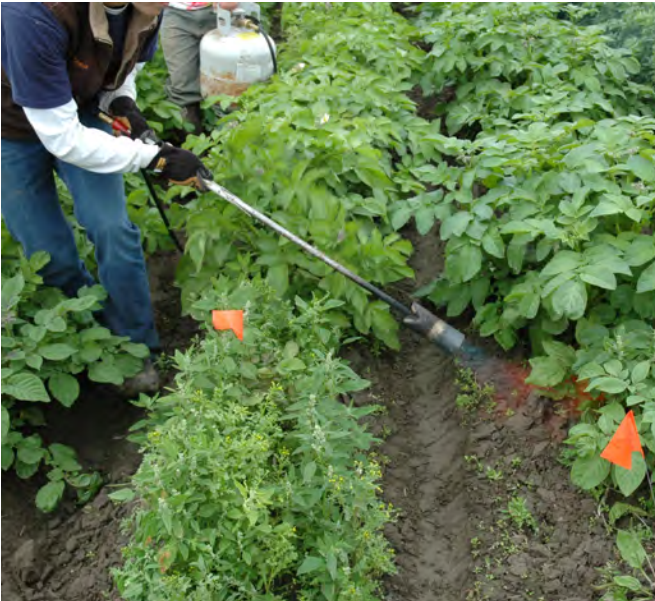
Flame weeding controls weeds within the potato row and on the sides of raised potato beds.

chopping action to remove the weed roots or pulling entire weeds by hand can damage the tubers.