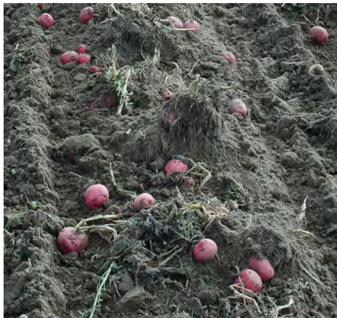
Cutting back the vines one to two weeks before harvest allows the potato skin to toughen before storage.

While the optimal storage condition for potatoes is a dark, cool, high humidity area, most homes are not equipped to meet the exact storage standards used by commercial producers. Simply storing your potatoes in a cool place where they are not exposed to light or at risk of freezing will suffice for a few months. If the potatoes freeze, they will fall apart once they are thawed and become inedible. A few